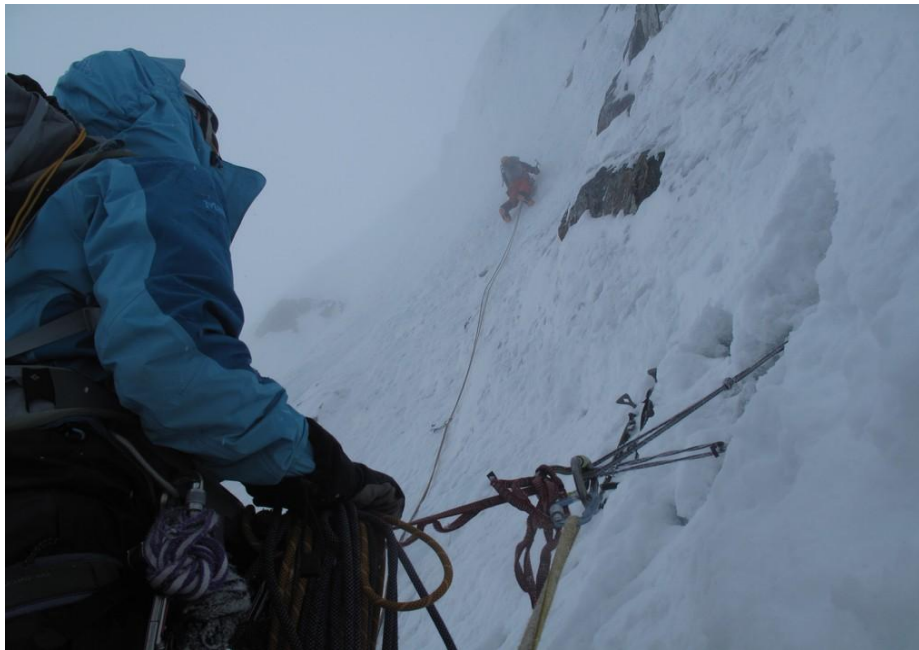
Climbing on unnamed peak, Lemaire Island.