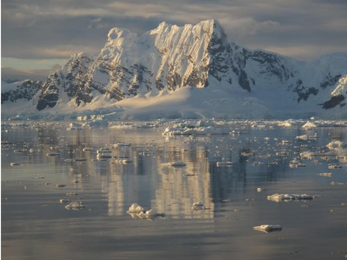
The South Face of an unclimbed peak on Lemaire Island, Paradise Bay. Attempted route goes up a central fluting to approximately 2/3rds the height of the face, and would have exited right of the central high point.