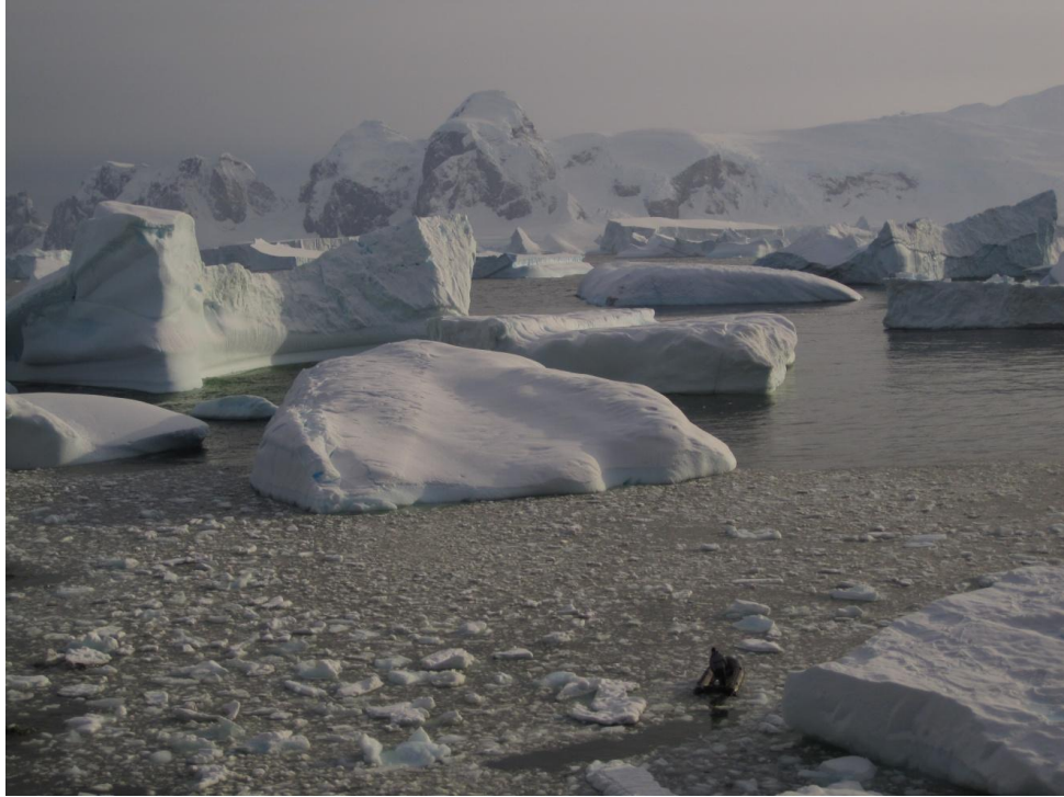
Approach to Cape Perez via zodiac. L Bradey