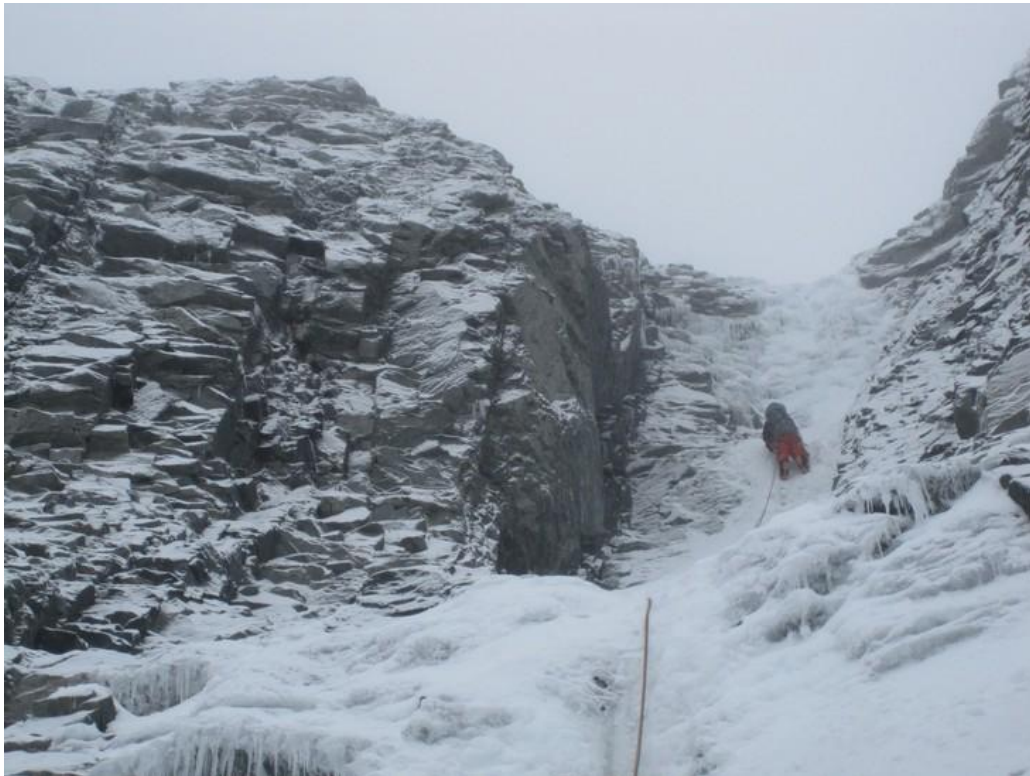
West Face, First Sister of Fief, Weincke Island.