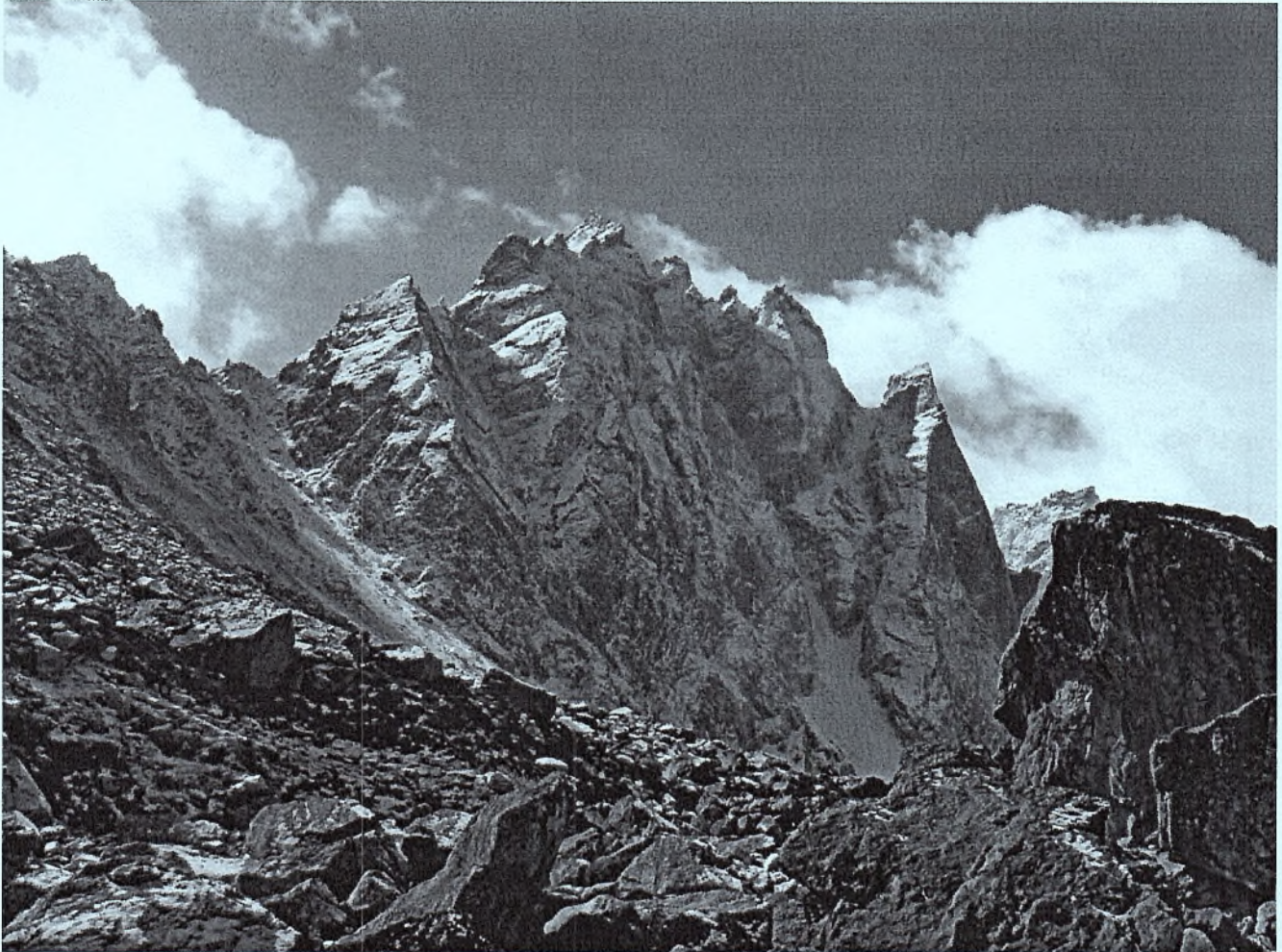
Examples of huge faces on the west side of the Chuwa Khola.