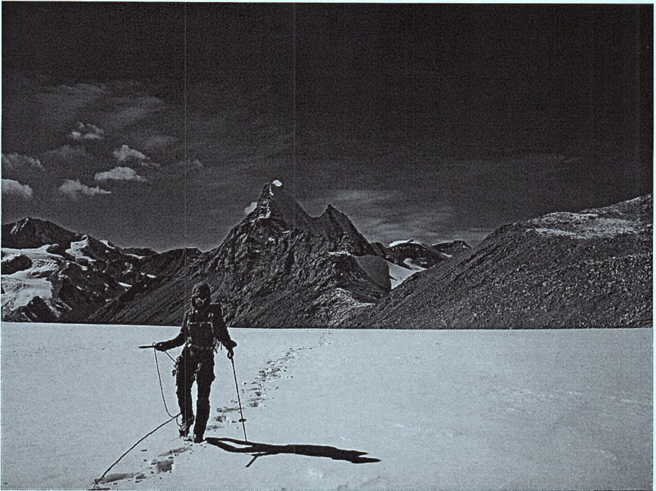
On a recce to the Tibet border. Chandi Himal Range looking towards Chandi Himal 6069 far right rock peak in background.

Heavy Bags, Moraines and Deep Snow are not a winning combination and after the 3 rd day of attempting to hike out, we had made 15km and most of us supporting minor injuries from the packs and rough terrain. It was at this point, when further poor weather beckoned that our agent stepped in with the offer of assistance through helicopter evacuation. It was very apparent that without leaving much of our kit (and that of our staff) therefore putting us and them in jeopardy, we would not be able to get out of the valley before the snow made matters worse.