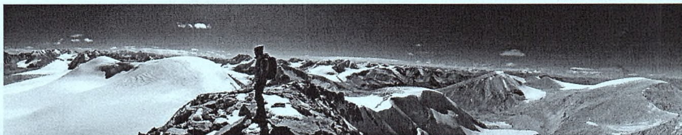
Panorama from nr. Peak 6069 looking to snowdome pk6024m.