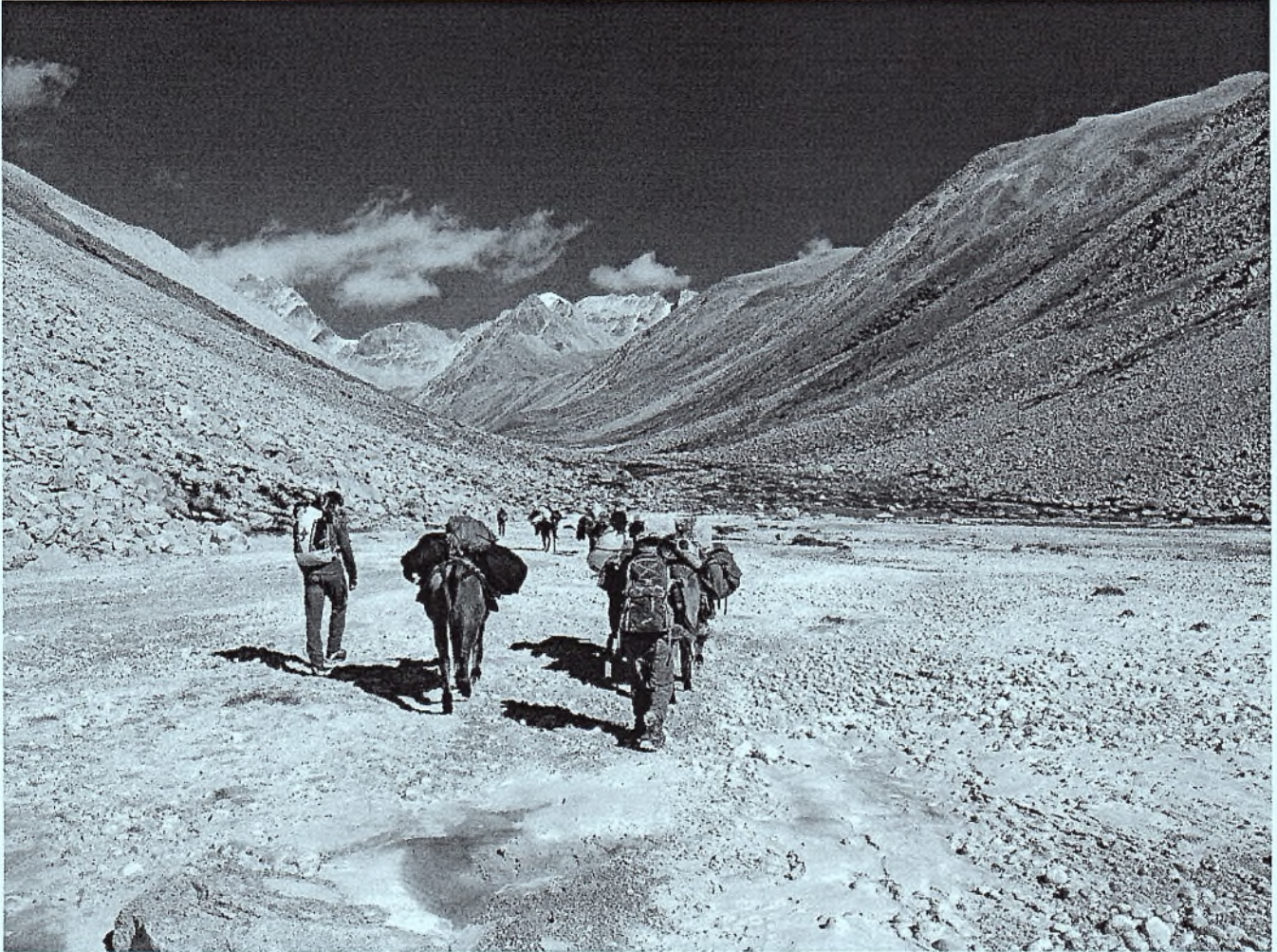
On the final day of the approach: Chandi Himal range in the background.

On the 28 th October the team started walking in from the village of Simikot, armed with 8 mules and some local staff, lots of provisions, food, fuel etc. The walk-in to base camp took the Dojam Khola and Chuwa Khola towards the Chang-La before turning to the Nin Khola in the direction of Chanwathan, this journey was slow with the group experiencing rough terrain and the mules finding life difficult picking a safe route between steep moraine bands, it was very apparent we were travelling in areas largely unexplored, even by locals.