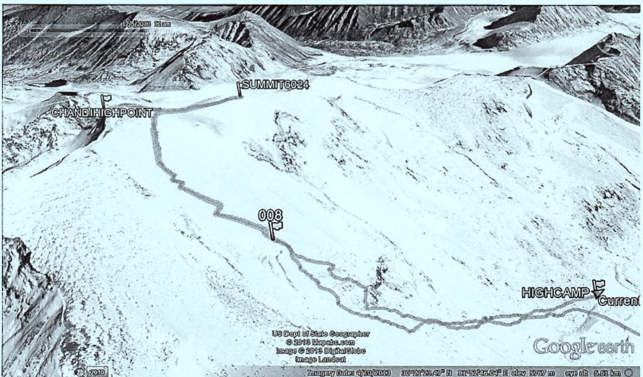
Google Earth GPS Track of Chandi Himal 6069 and 6024 Summits