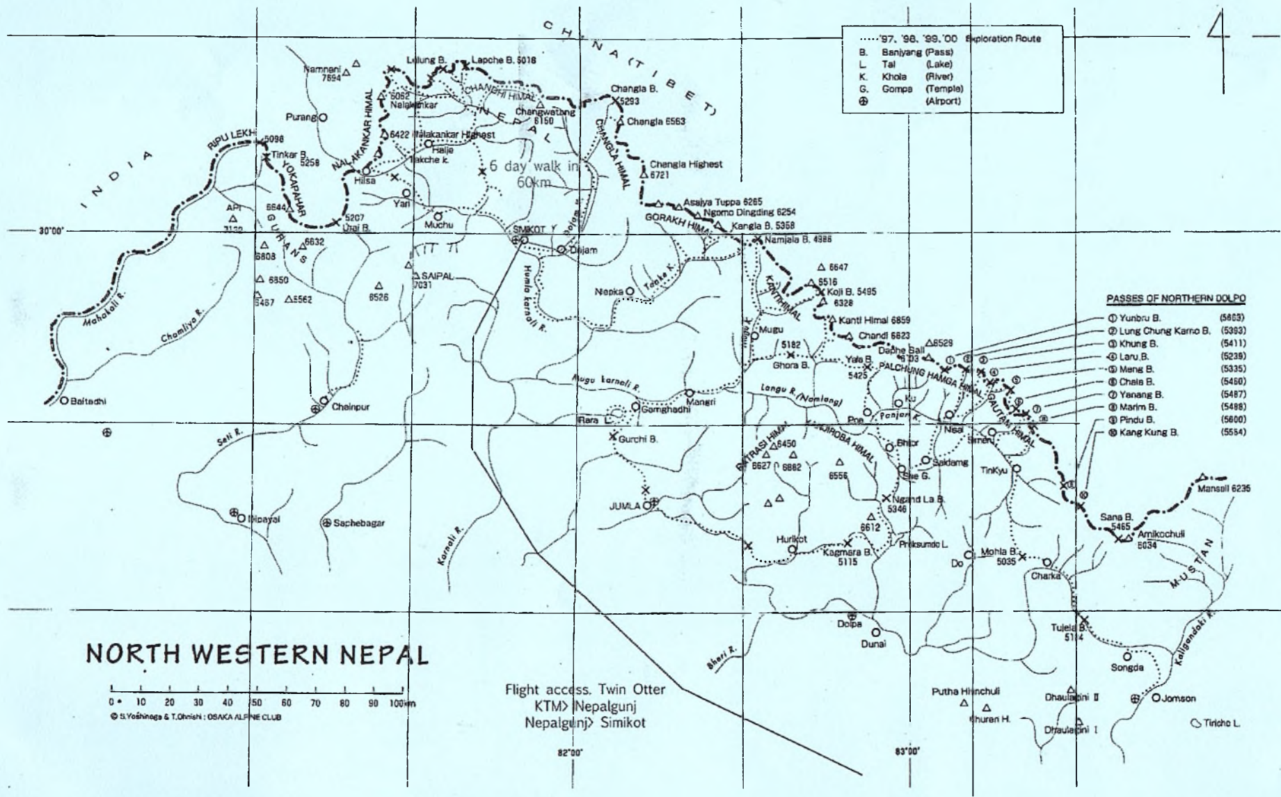
Far West Nepal Map. Red Line = Flight, Green line = on foot.