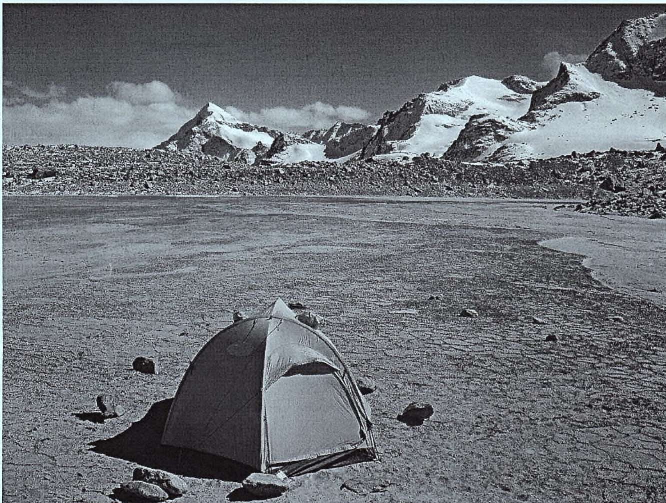
Advanced Base Camp 5400m

However on the 6 th November Dave and Guy progressed west to establish an advanced base camp for Chandi Himal in the bottom of a dried up dusty lake at c5450m (opposite Chanwathan). After a particularly rough night, the stars had aligned and we awoke to clear yet windy weather. The team ascended moraines and surmounted the snout of the glacier before heading on easy terrain for the summit of Chandi Himal. That morning we reached the col at approx 5950m, left all of our technical equipment at the col as the going looked straight forward, we ascended a rocky ridge from the east towards the summit, still on easy ground and therefore soloing. Toward the summit at c.6000m Dave and Guy met a pillar of loose rock which formed the summit itself with an extremely loose rock ridge running to it, unfortunately this meant that with our lack of kit for technical climbing and the risk of loose rock ruining our expedition we retreated to the col.