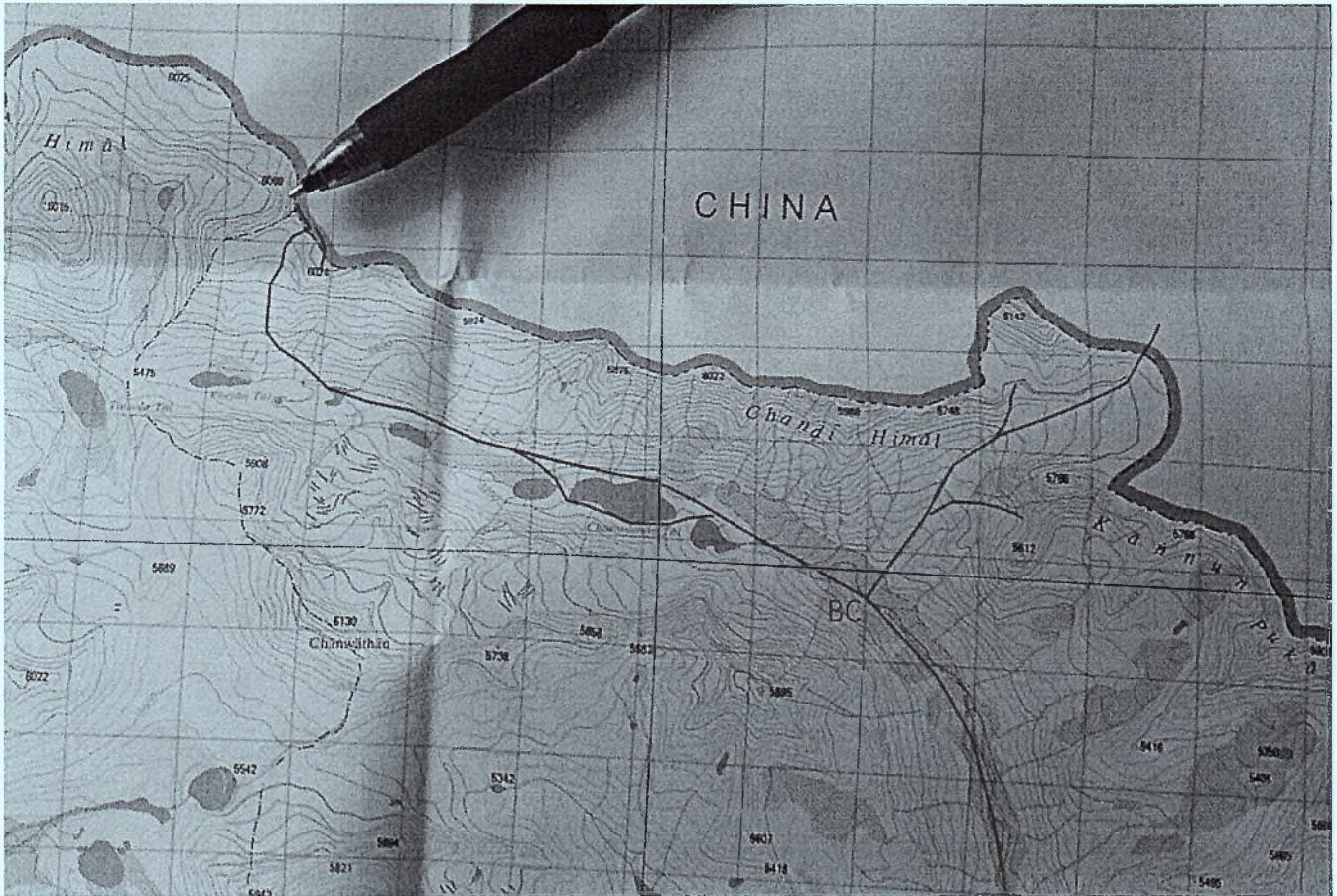
Red line shows journey area explored around base camp