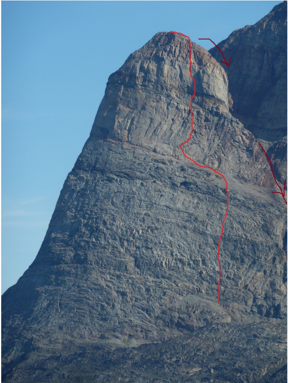
View of Uummannaq NW peak with 'Islands in the Sky' marked in red and descent in brown