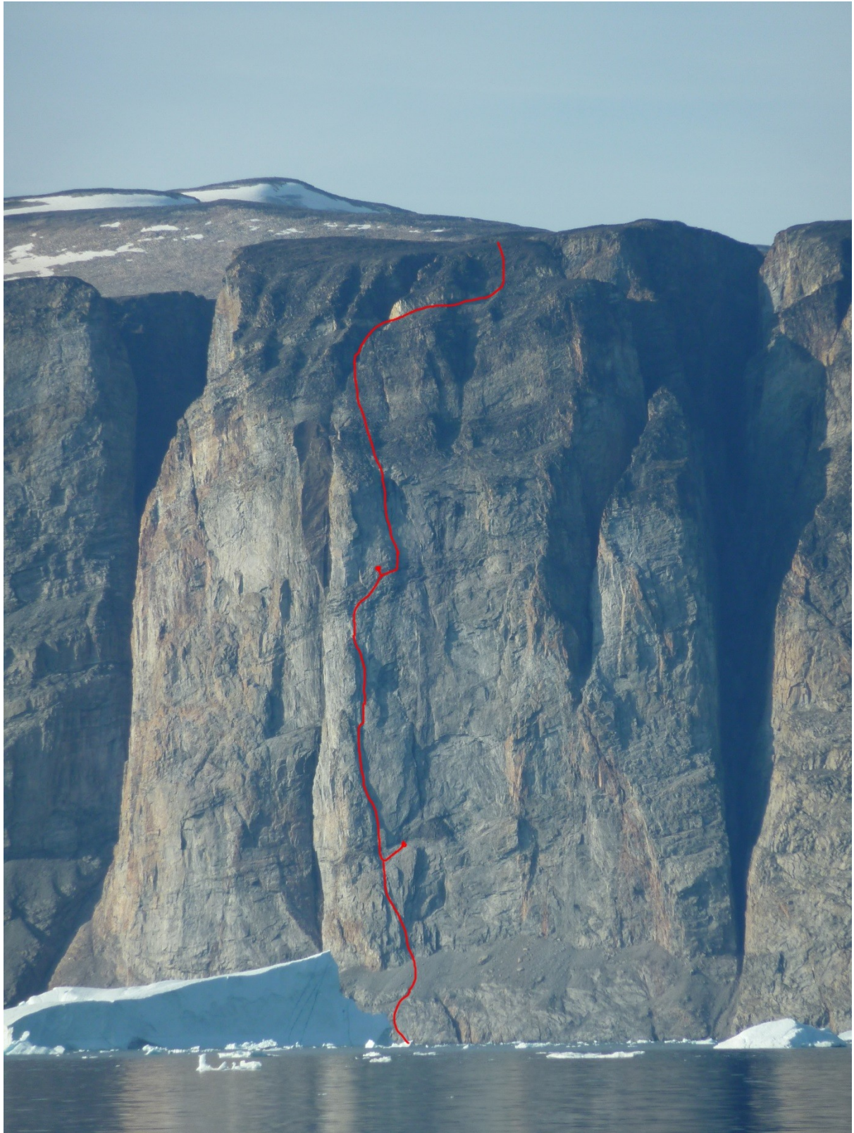
View of NE face of Ivnarssuaq Great Wall with 'The Incredible Orange' marked in red with bivy spots as red dots