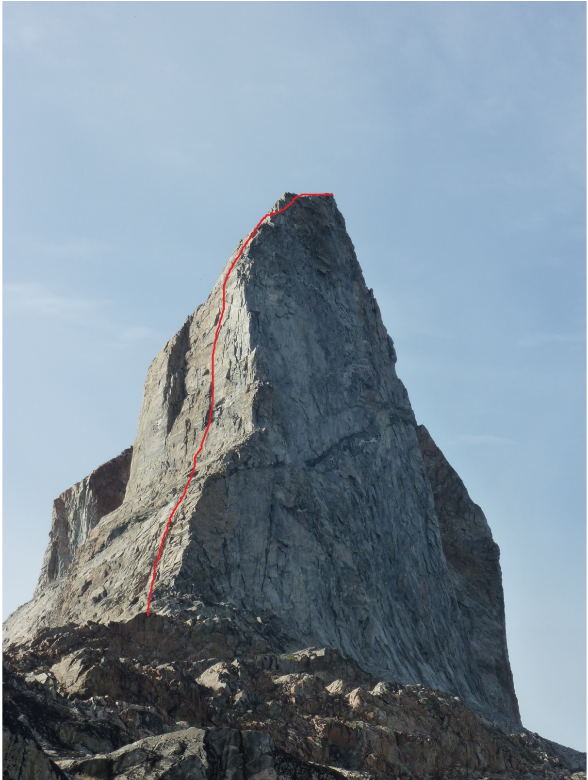
View of E face of Umanatsiaq Mountain with 'Flake or Death' marked in red