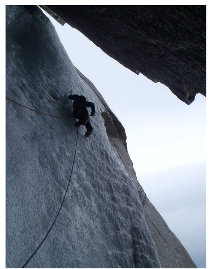
The crux ice pitch of Super Domo