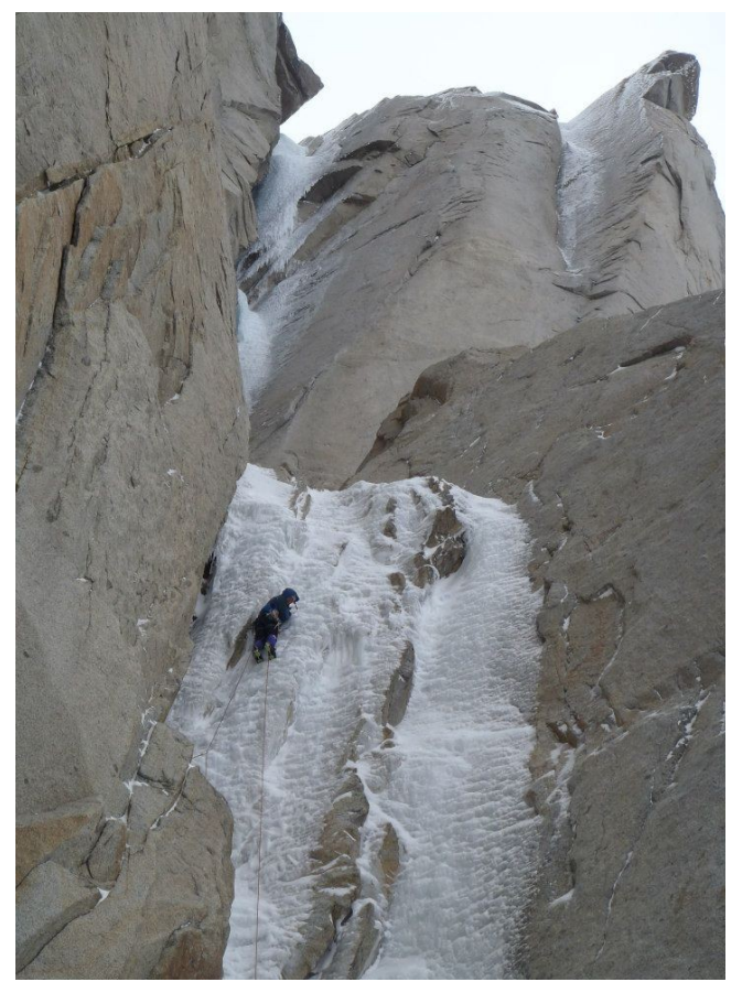
The ice upper ice chimney of Superdomo