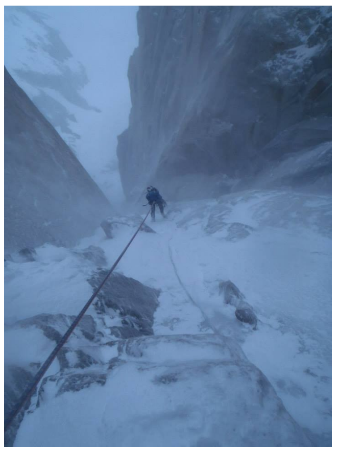
Retreating off Super Canaleta

It got light again as we headed back up and over the Filo de Sendero Homre. And we eventually staggered back into Niponino at around 10am. 35 hours after setting off.