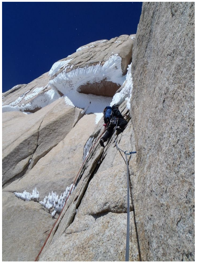
Moving up the headwall.