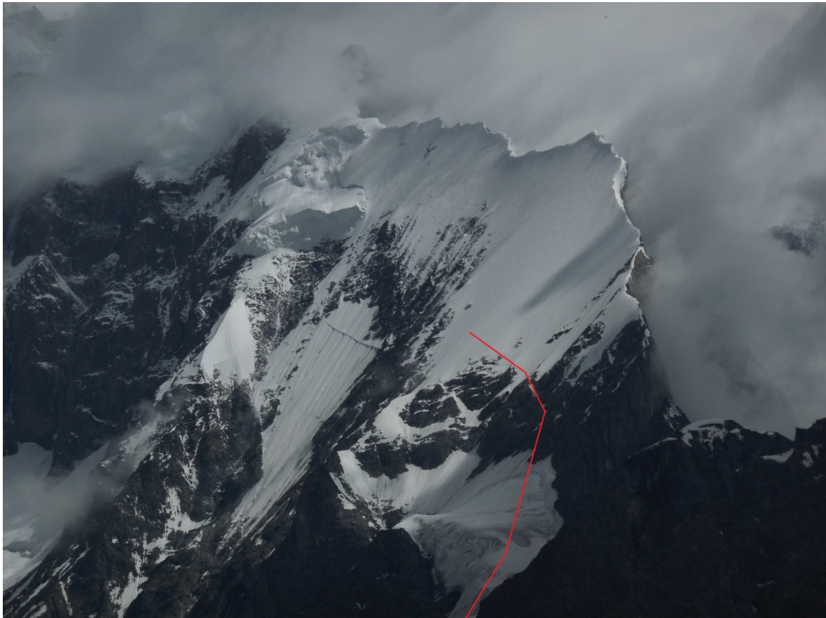
Part of the south ridge of Muchu Chhish and the line of our attempt.

The compiler of this report and the members of the expedition agree that any or all of the report may be copied for the purposes of private research.