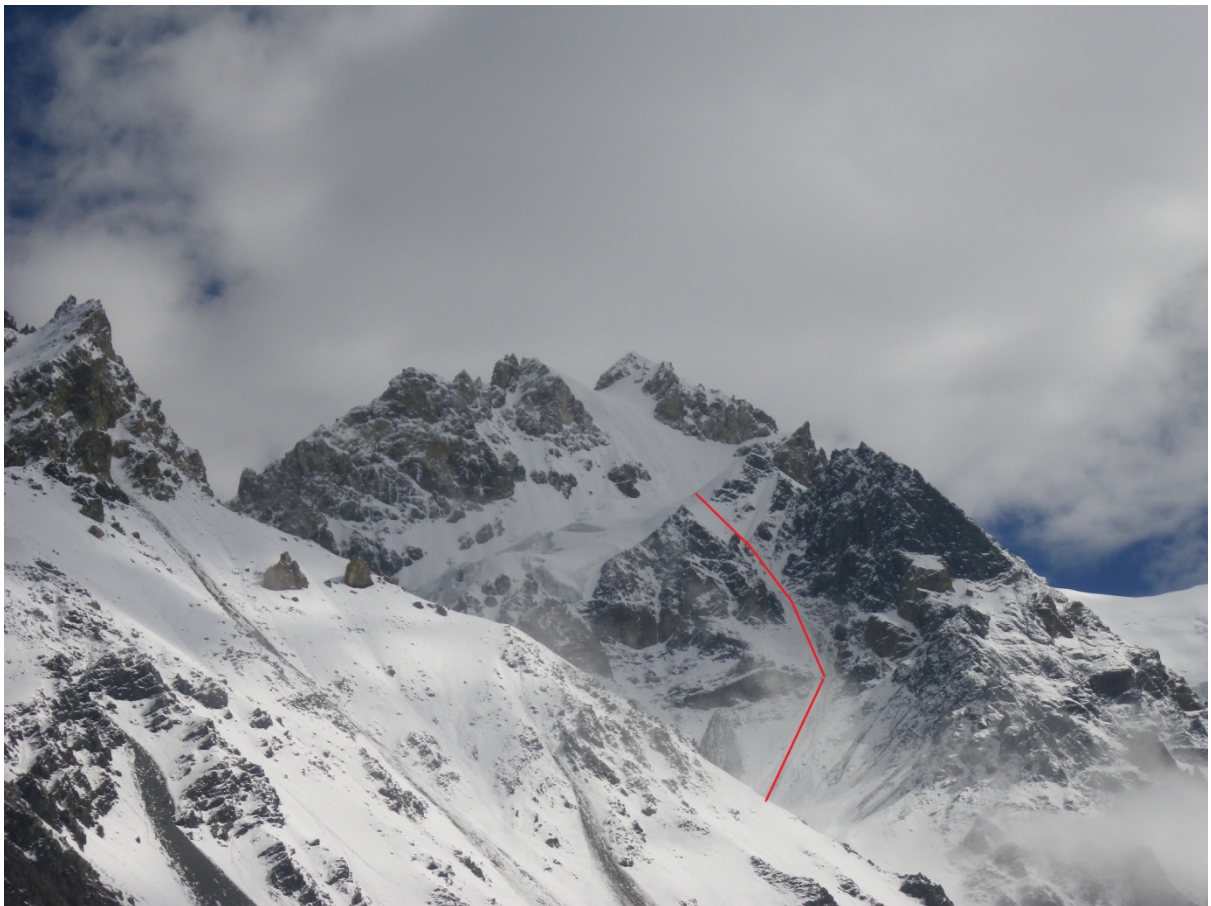
Attempt on Pregar south face.