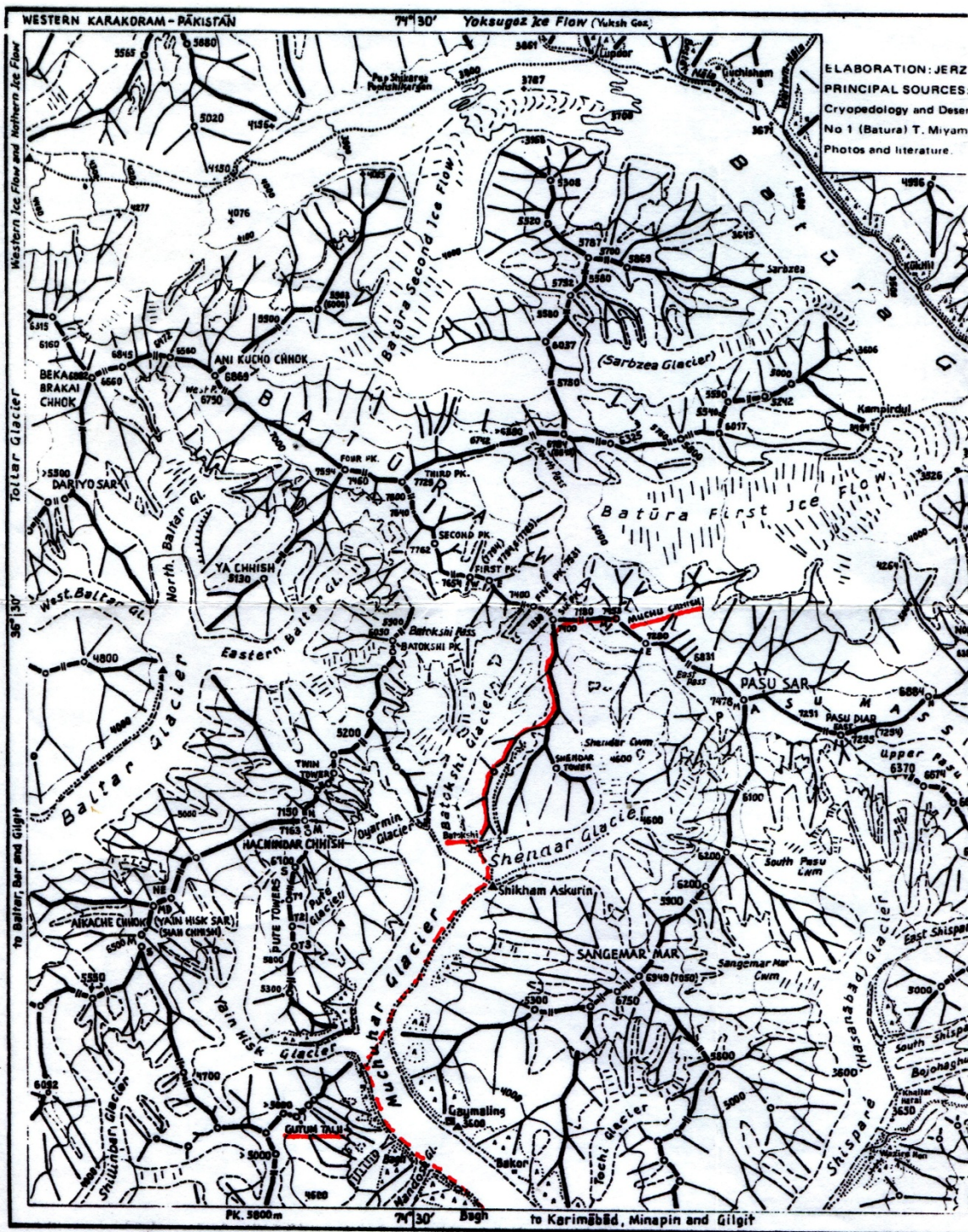
Map of the Batura Muztagh.