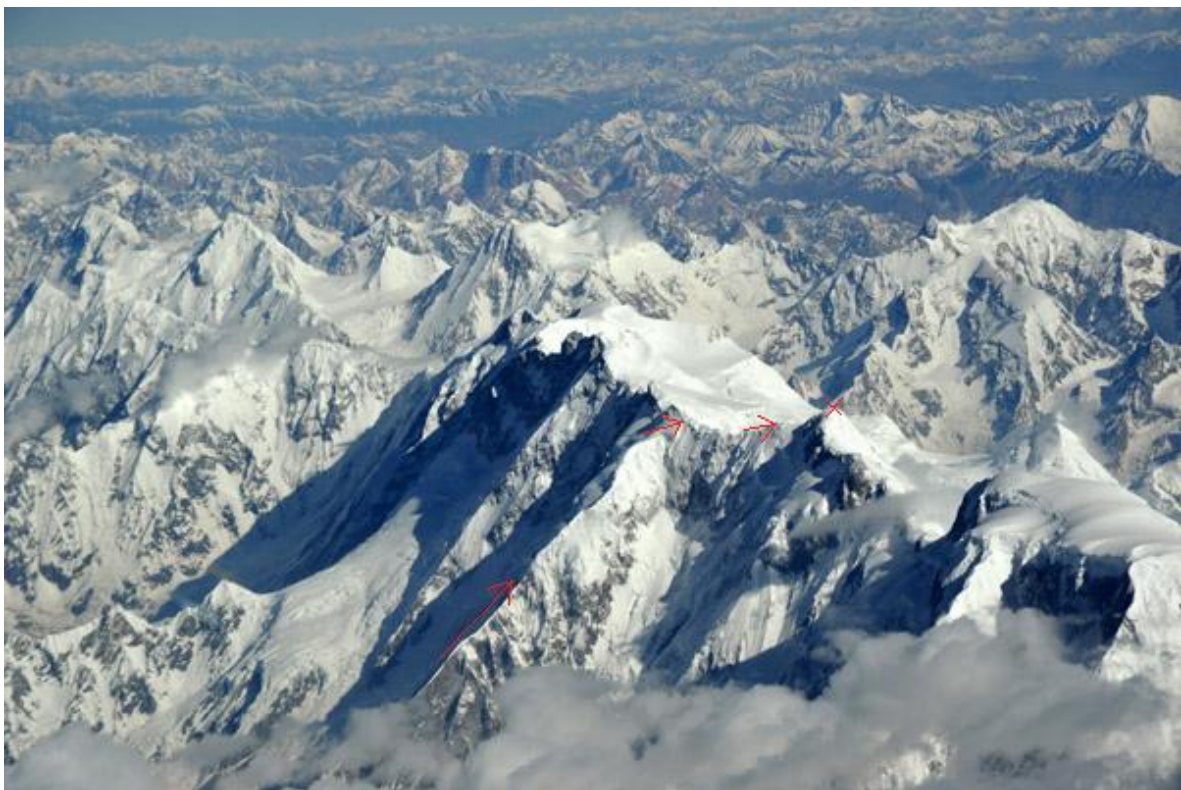
Picture showing our planned route up the south ridge and the traverse to the summit of Muchu Chhish.