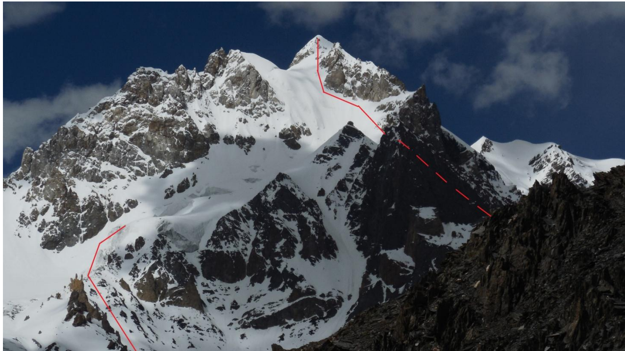
The line of our first attempt on Pregar (left) and second attempt (right).