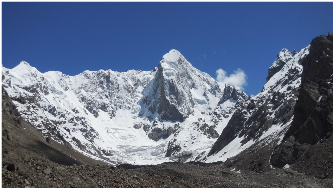
Machu with the west ridge (left) and the southwest ridge (far left).