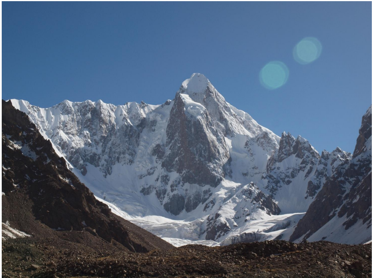
Machu with the west ridge (left) and the southeast ridge (right).