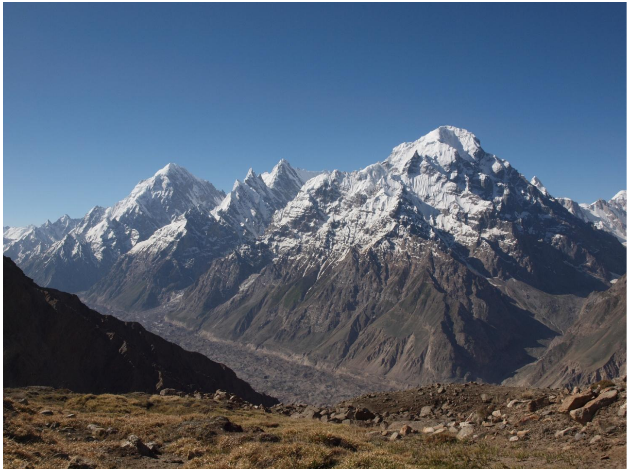
Unclimbed peaks on the other side of the Hispar Glacier from Machu base camp. From left to right: Makrong Chhish 6607m, Gandes Chhish 6346m and Men Chhish 6407m.