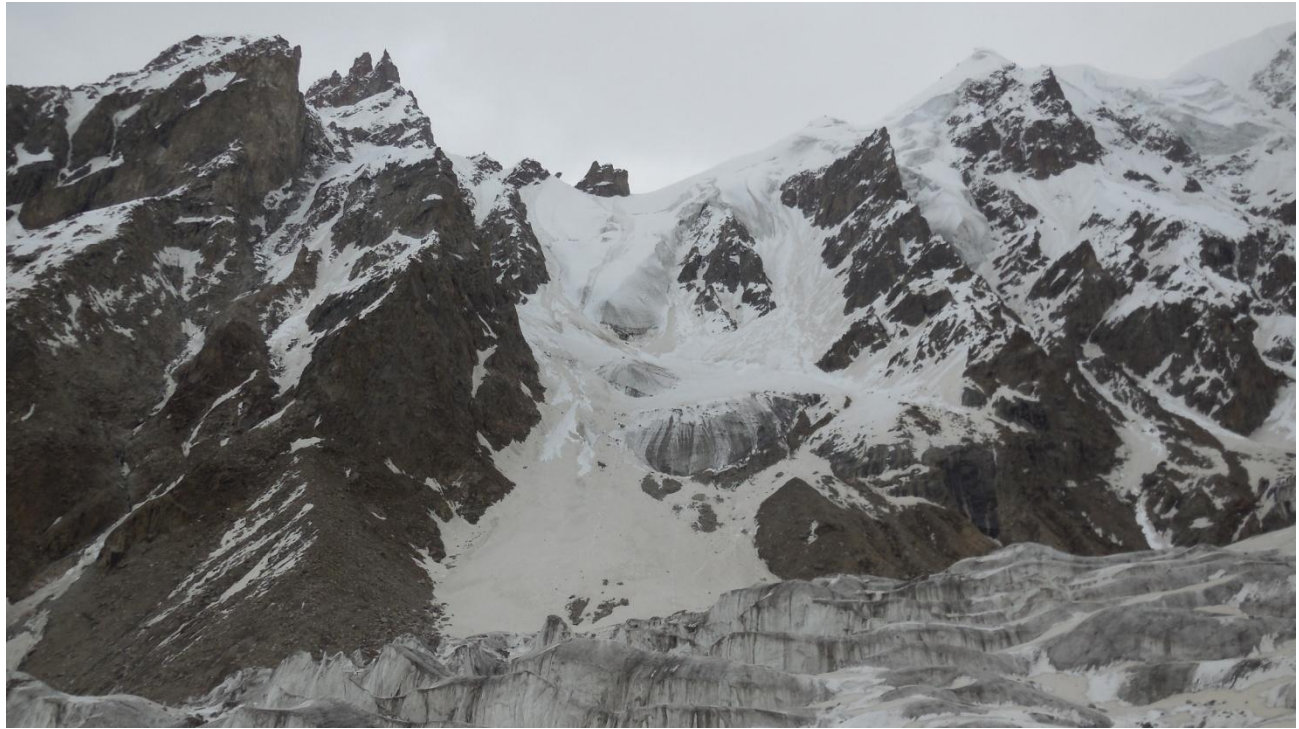
Slopes leading to the southwest ridge beyond the rock peak on the left which stopped us.