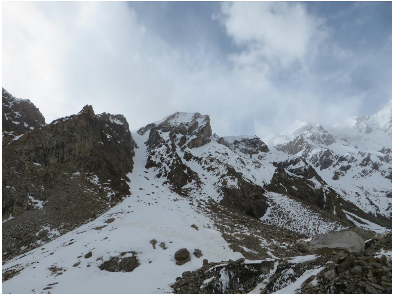
The couloir we climbed to get onto the southwest ridge.