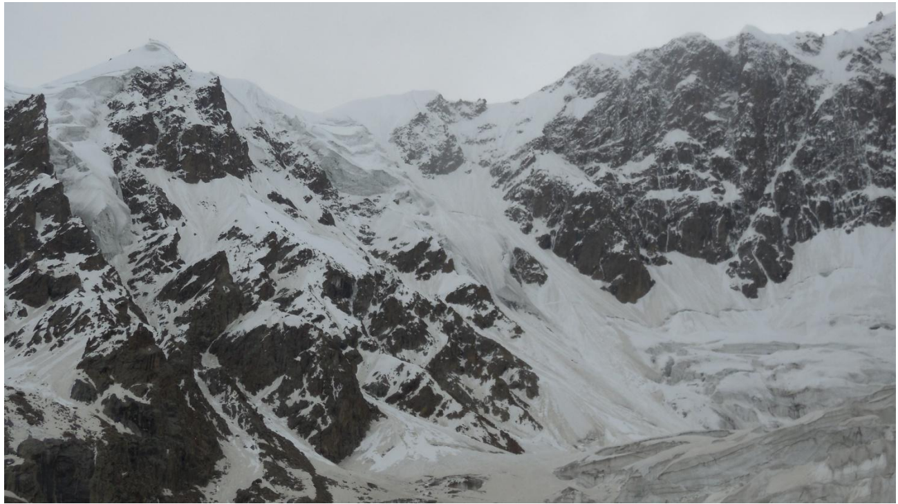
The long couloir (centre) from the Machu Glacier leading directly to the west ridge.