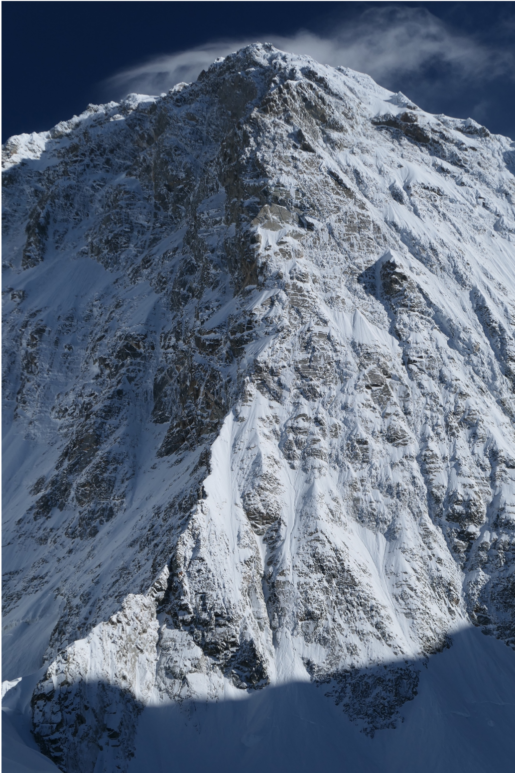
The south buttress is genuinely awesome.