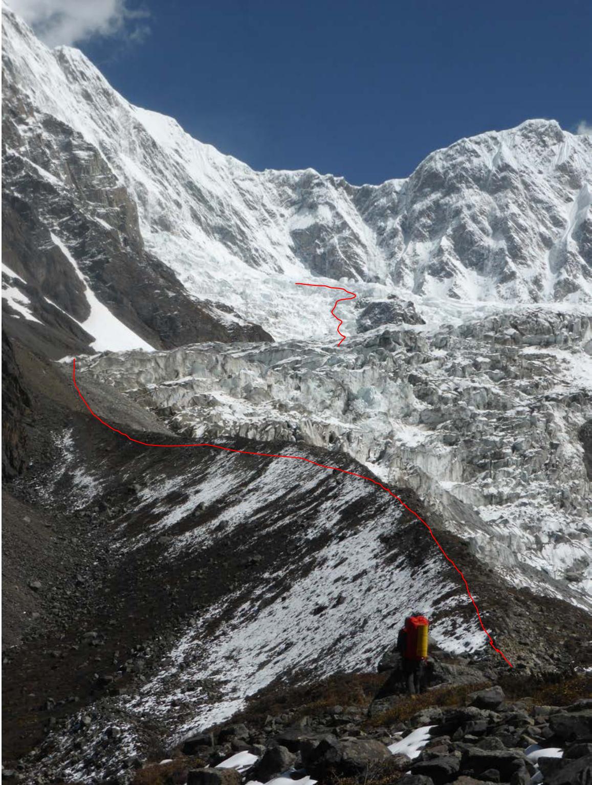
The approach to the south face is long, complex and quite dangerous.