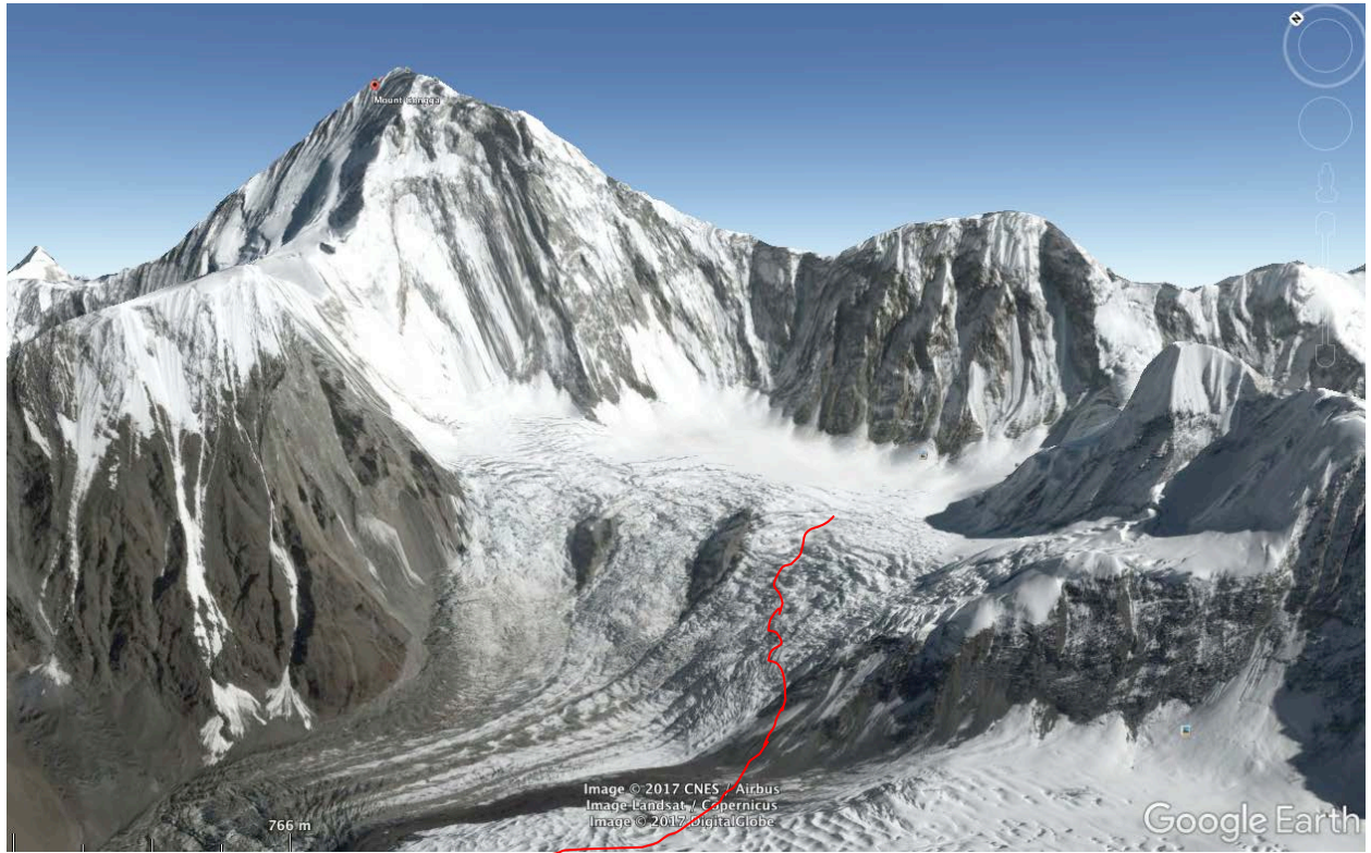
Route to base of hard climbing. This was our high point.