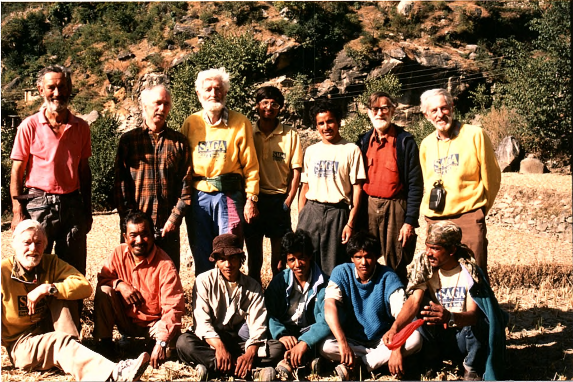
Top: Jaonli (21,760ft; 6,632m)