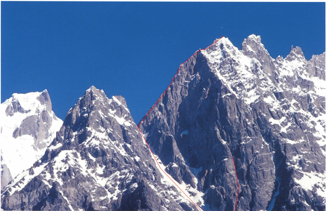
Pute Tower 3 5860m.