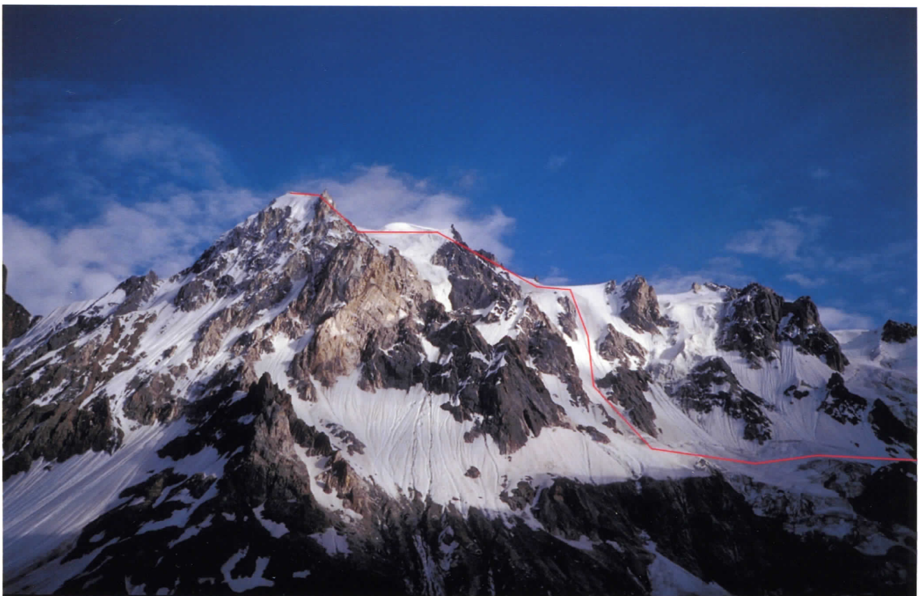
Gutum Talji 5230m.

First ascent route up the south ridge and attempt on the south east face.