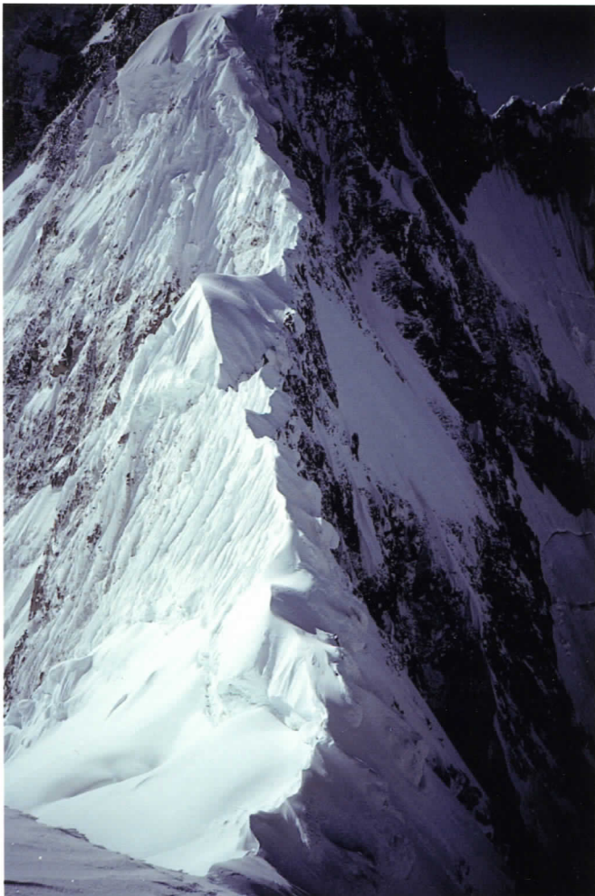
Unclimbed northwest ridge of Beka Brakai Chhok.